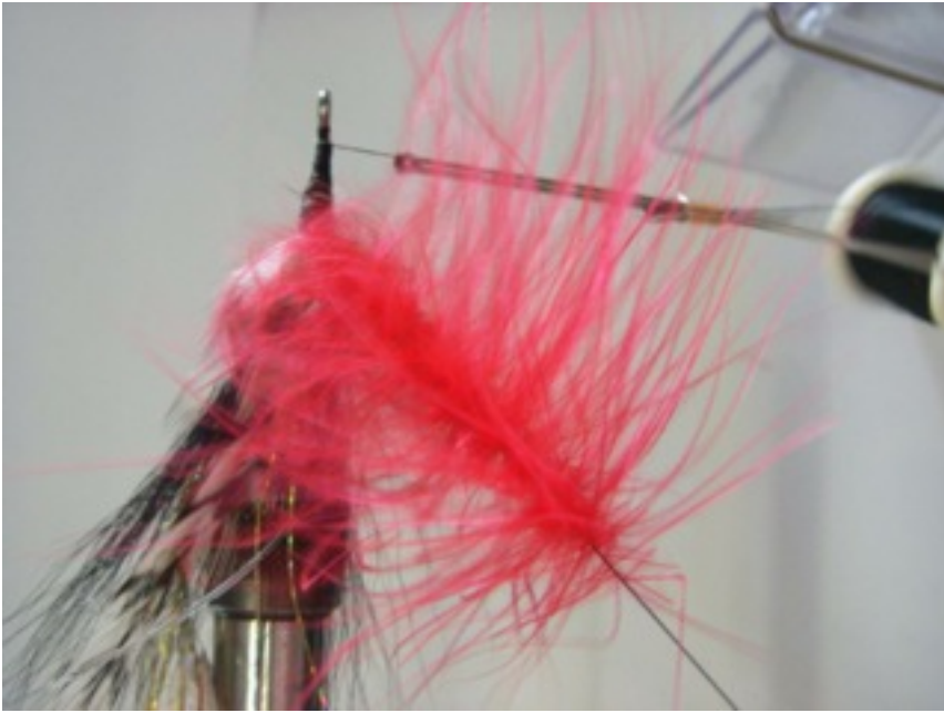
Step 9 - Spin and create a fluffy brush