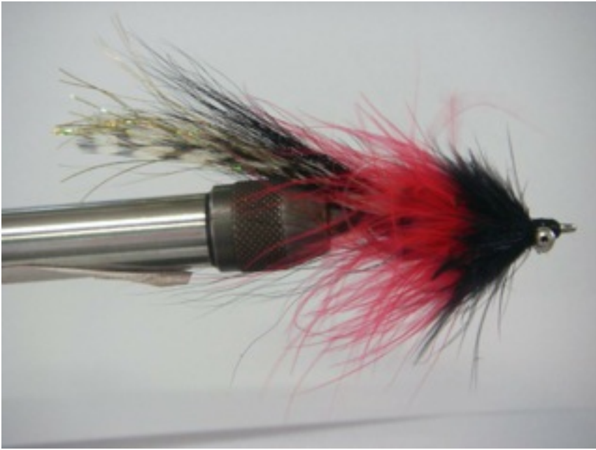
Step 17 - Finished fly. Check how concealed the weed guard is.