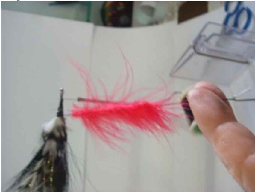
Step8 - Place exposed ends in dubbing loop