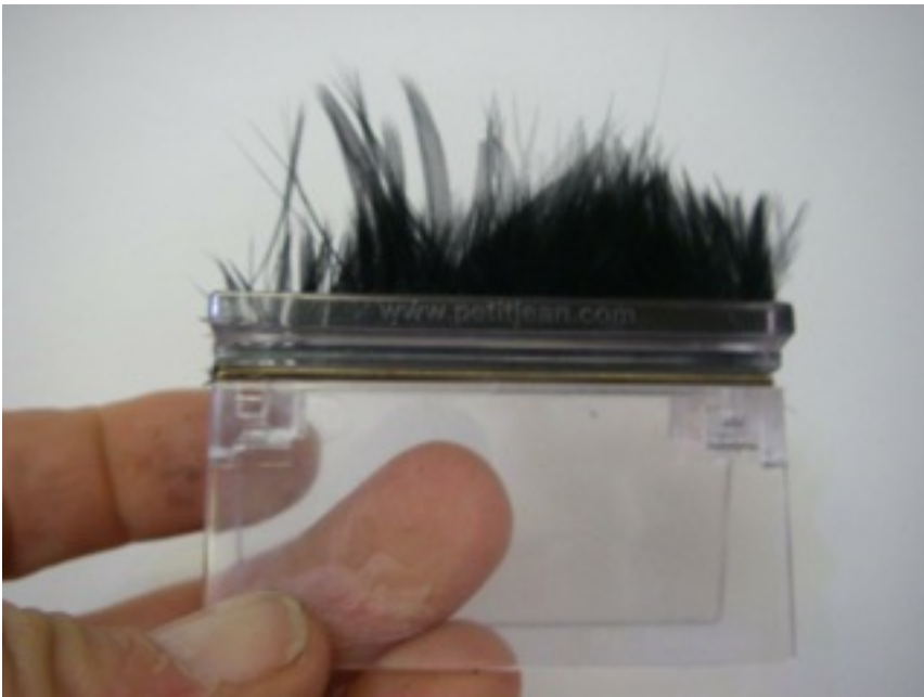
Step 11 - Using part A of Magic Tool