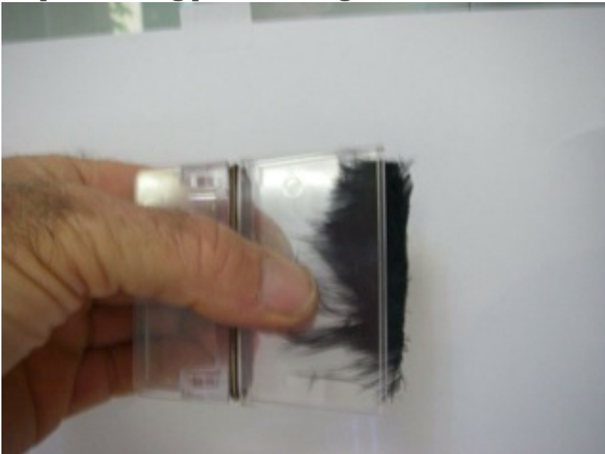
Step 12 - Using Part B of Magic tool