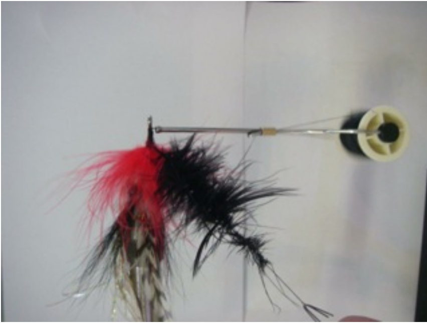
Step 13 - Spin into a brush