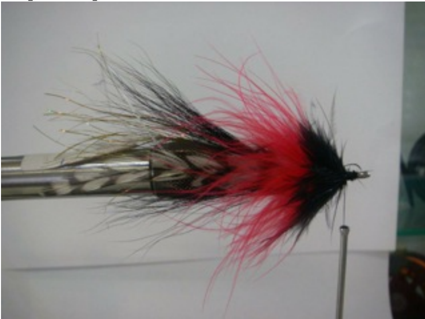
Step 14 - Wind forward to cover the rest of the shank. Leave enough room to tie in the eyes.