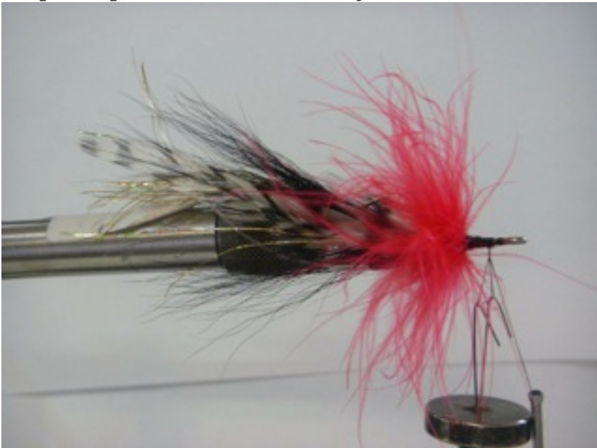
Step 10 - Wind forward to cover the first half of the shank of the hook. Make another dubbing loop and repeat the above steps for the Schalappen feather