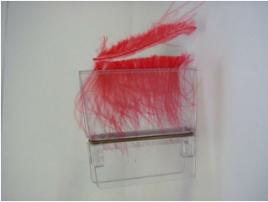
Step 7- Remove the Quill of the feather